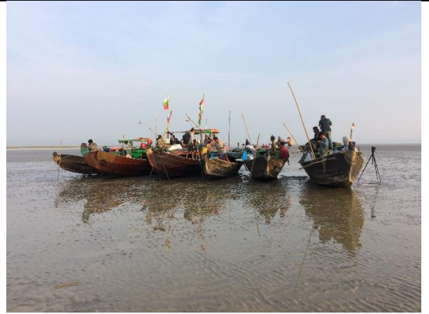
Small fishing boats for daily survey