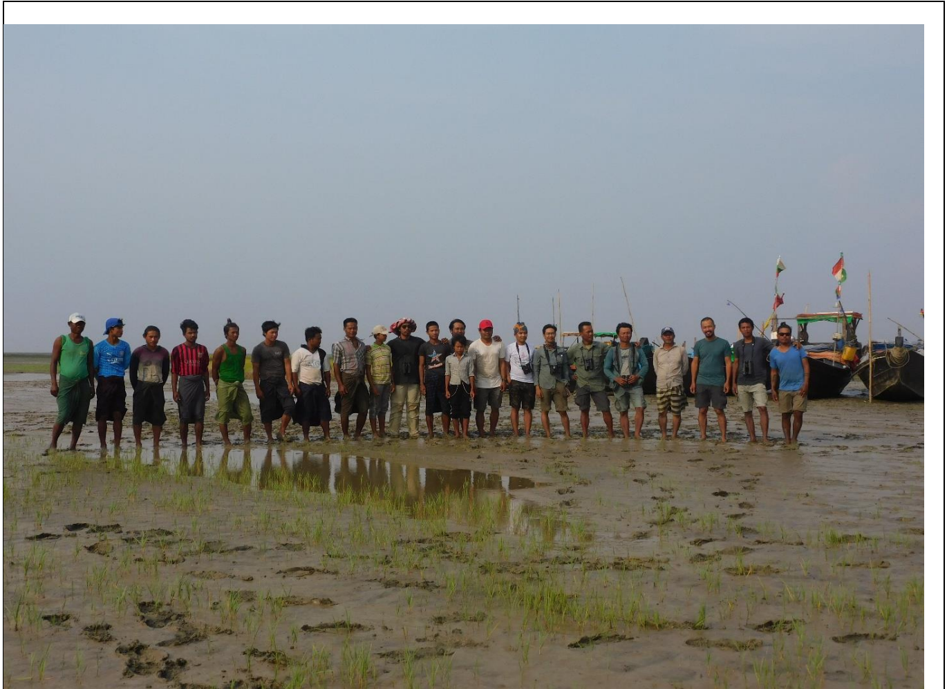
Small Boat crews, survey team and film team members