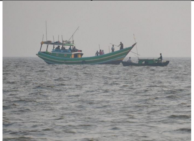
Investigation where to anchor before low tide