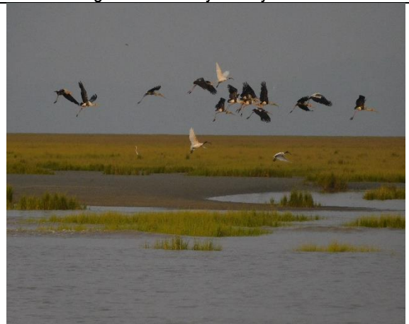
Ibis and Painted Stock flock