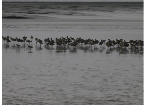
A flock of Black-tailed Godwit