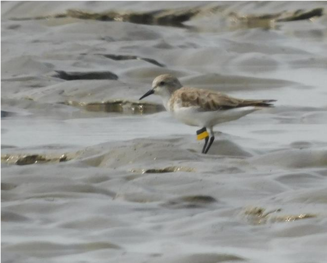
Red-necked Stint with colour markings from Kamchatka