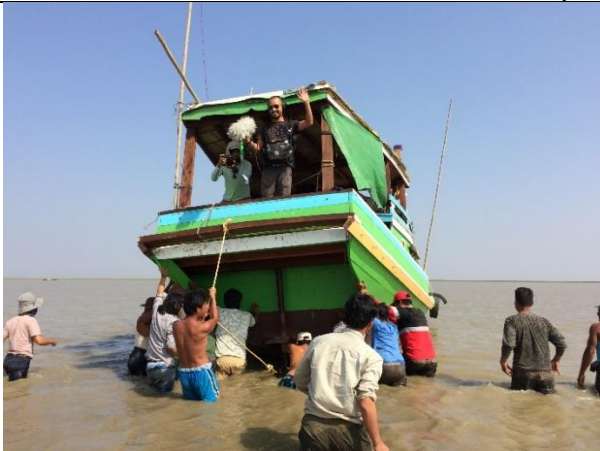
Departure time pushing big boat when high tide