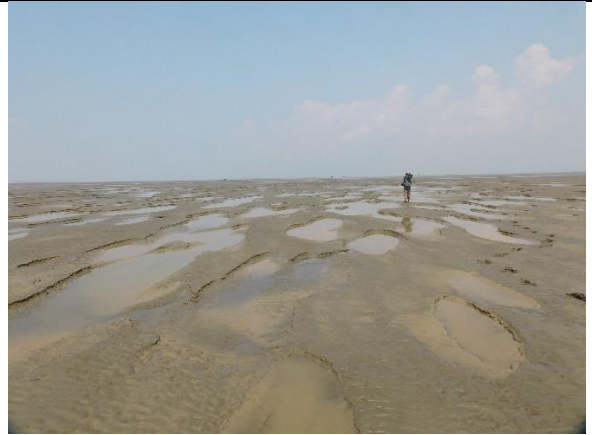
Action of surveyors on mudflat