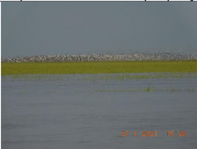
Shorebird flock during high tide