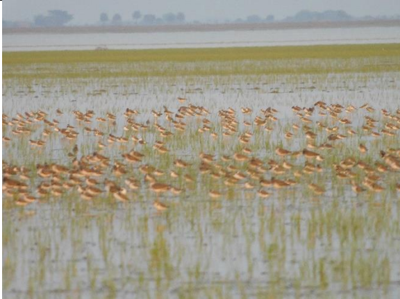
Mixed wader flock waiting to feed