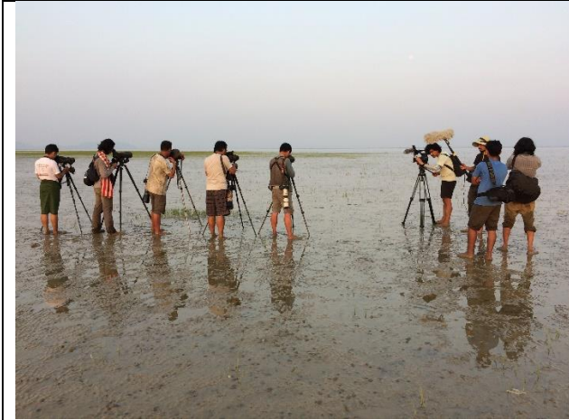
Surveyors and camera crews on mudflat